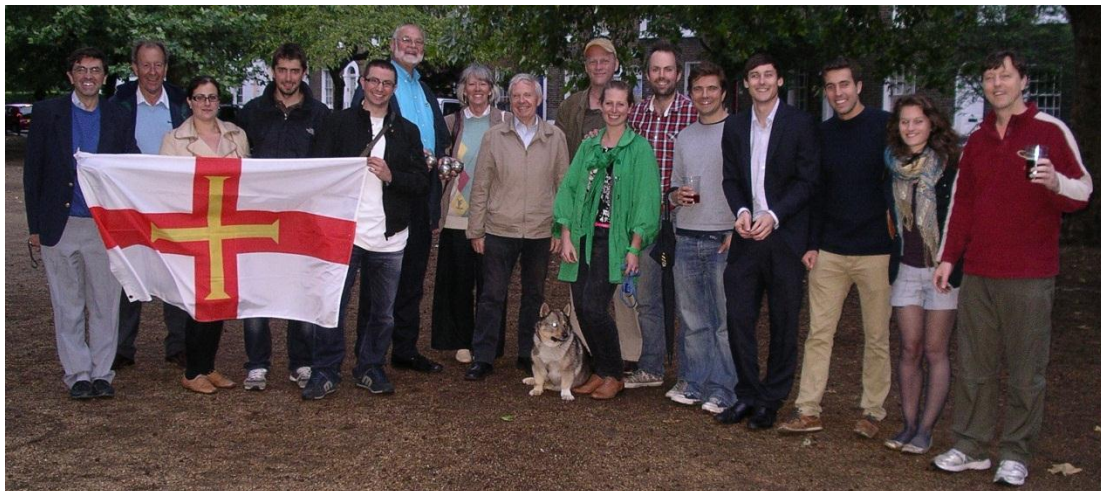
The 2 nd Annual Boules Muratti

We've been planning the meetings and events to commemorate the Society's up-coming 70 th anniversary in 2013, and we'll be letting you know about some of them in this edition of the newsletter as well as other bits of news and information.