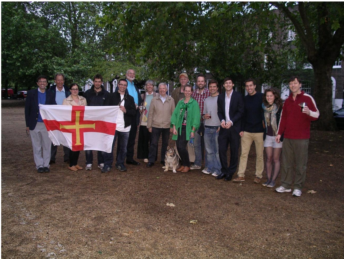
Flying the Flag – the victorious Guernsey Boules Muratti team 2012