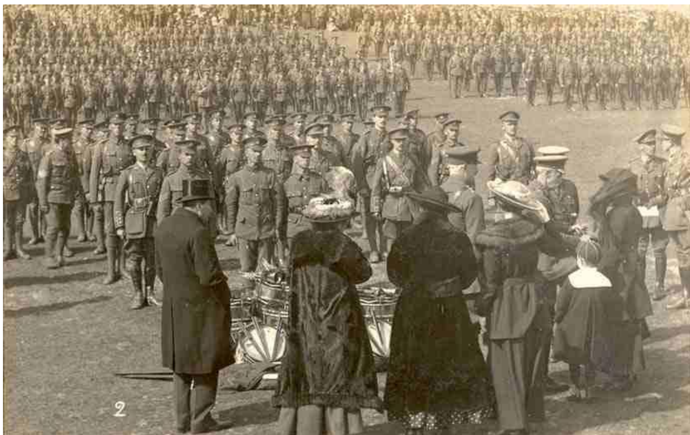
RGLI receiving their Colours at L'Ancrese, May 3 rd 1917