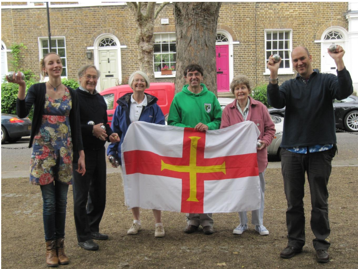
Despite defeat The Guernsey Society proudly flew the flag!

On Saturday 1 st June we met in Cleaver Square, London, for lunch followed by a few rounds of boules and some very tasty gache meleee. This was in preparation for the third annual Boules Muratti against the Jersey Society in London on 22 nd June where we hoped to hold onto our unbeaten record. In the event illness meant that our team was depleted and the Jersey team were victorious. We're already preparing to regain the crown in 2014!