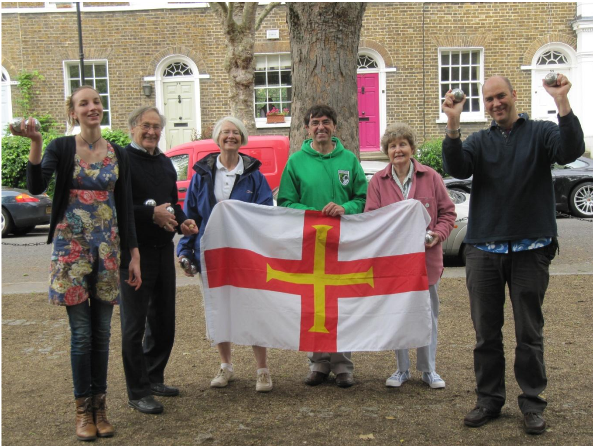
Despite defeat The Guernsey Society proudly flew the flag!

On Saturday 1 st June we met in Cleaver Square, London, for lunch followed by a few rounds of boules and some very tasty gache meleee. This was in preparation for the third annual Boules Muratti against the Jersey Society in London on 22 nd June where we hoped to hold onto our unbeaten record. In the event illness meant that our team was depleted and the Jersey team were victorious. We're already preparing to regain the crown in 2014!